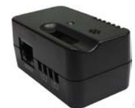
10120545 - EMD for NMC Card