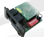
10120592 - Mini Modbus Card 3