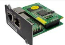
10120599 - Mini NMC Card