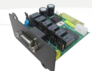
10120598 - Mini AS400 Card 5