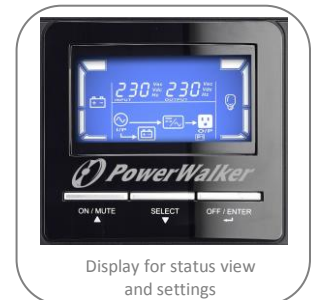
Display for status view and settings