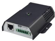
EMD for SNMP Manager Environmental Monitoring Device Monitor Temperature & Humidity Datasheet: Link Item No.: 10120544