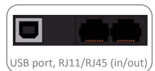
USB port, RJ11/RJ45 (in/out)