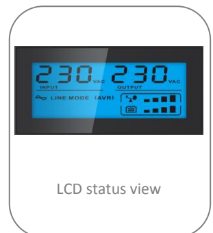
LCD status view