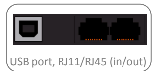
USB port, RJ11/RJ45 (in/out)