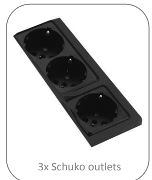
3x Schuko outlets